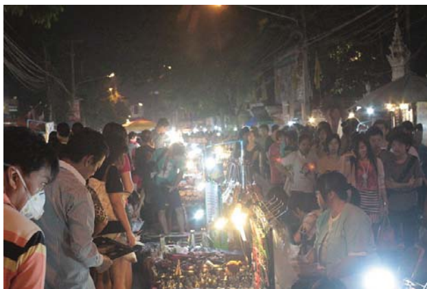
Chiang Mai Night Market

After the company visit, you will go back to Bangkok on a wooden boat along the shores of Chaophraya River, especially impressive when darkness falls.