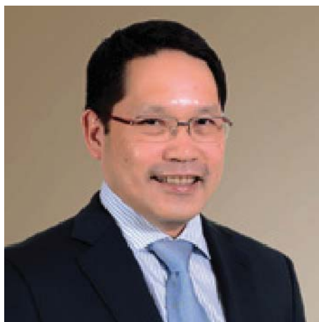
Dr. Uttama Savanayana Senior Vice President, Bangkok University Executive Director, BUSEM From 1 June 2015: President, Bangkok University

“Bangkok University is proud to share our vision of excellence in entrepreneurial development for advancement of knowledge and progression of social growth. BUSEM, our newest academic faculty, is a testament to the strategic commitment that our institution has made towards driving and affecting positive change around us. We have chosen to partner with Babson College in order to harness the world’s best practices in entrepreneurship education, and are greatly honoured to be in a unique position to deliver this expertise to our national community and nearby region.”