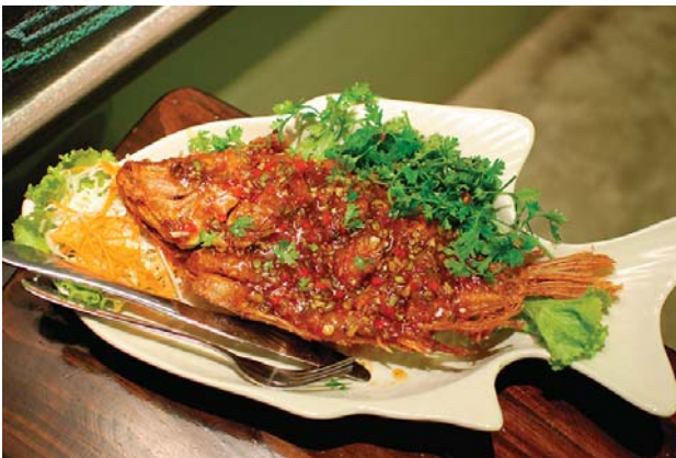
Pla Tod Sam Rod - a tasty Thai dish

In chronological order, we want to give you an overview of why some elements became integral part of this unique Summer University program.