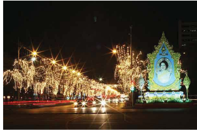
Street decoration in Bangkok at HM the Queen's Birthday

During the first three evenings, we will invite you to different Thai restaurants and eateries in order to make you familiar with Thai dishes. Nothing is more frustrating than standing hungry in front of a food stall but not knowing whether you could eat what you see there. You will taste Central, Northern and Southern Thai dishes and learn how to pronounce the names of those dishes you like best. Certainly, we will also introduce you to Isaan Food, the dishes from the Northeast of Thailand.