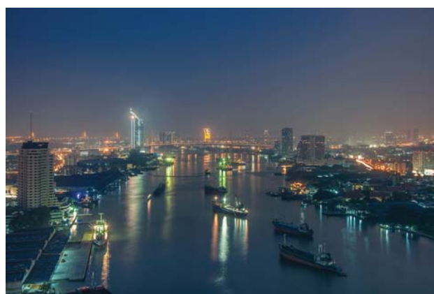
Chaophraya River, Bangkok

Our experience in organizing Summer Universities taught us, that our participants want some free time for shopping at the end of the program. Well, the conditions are great: We are in Bangkok, and there we have some of the best shopping centers in Asia. Enjoy!