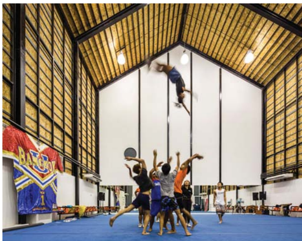
Cheerleader training at Bangkok University

Chiang Mai is on top of the wish list of almost every foreign visitor to Thailand, and so is Chiang Mai's Sunday Market. We fly to Chiang Mai in the morning, thus having time for a guided City Tour in the afternoon, before ending the day on the Sunday Market when the heat of the day is gone. The next day, you will get in touch with elephants big and small, and enjoy the most famous attraction that Northern Thailand has to offer: River Rafting.