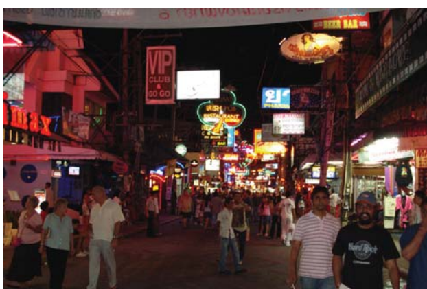
Pattaya at night

You can opt for some tanning sessions (take a good high-factor sun protection all the time!), enjoy a Thai Massage, rent a boat for a tour around the island, ride the banana or a jet-ski (all at your own expense). In this fine and white sand, playing beach ball or beach volleyball is sheer fun for those who need some tougher action.